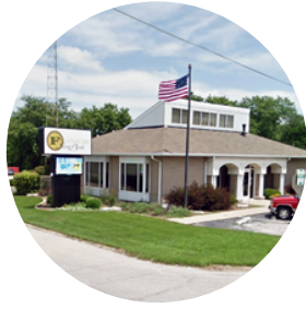
El Paso (309) 527-7300