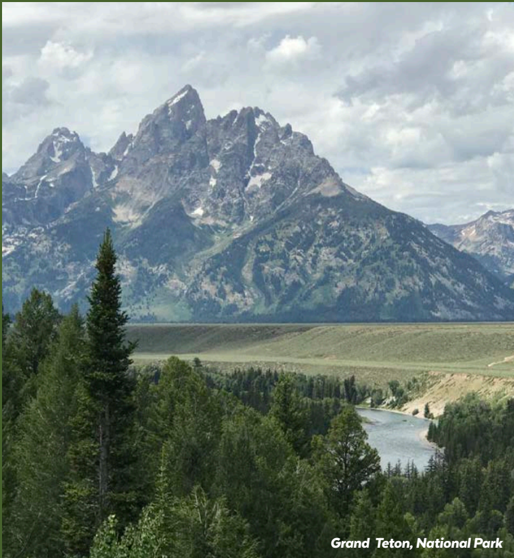
Grand Teton, National Park

Follow us on Facebook! We post pictures of trips and fun information on our Flanagan State Bank page.