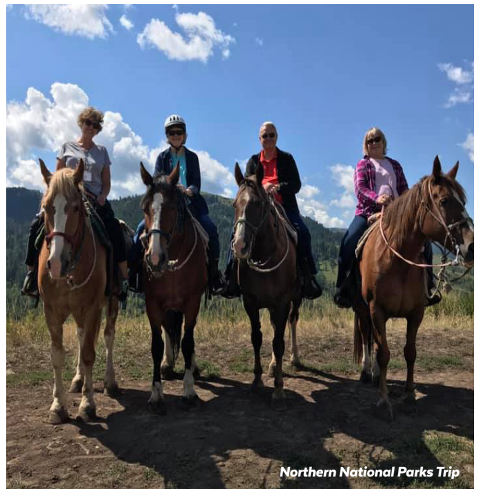
Northern National Parks Trip

This trip includes transportation, hot plated lunch and upgraded dessert choices, pre-show with the Circa 21 bootleggers, afternoon production of The Savannah Sipping Society , all taxes and gratuities. We hope you will join us!