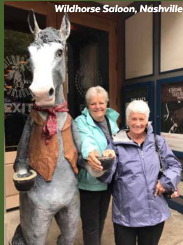
Wildhorse Saloon, Nashville